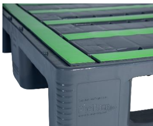
Anti-slip stripes on the top