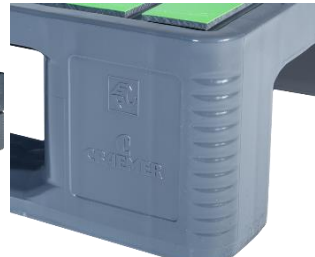
Rounded corners with notches for securing the stretch film