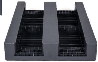
Closed running boards with a high sliding friction coefficient