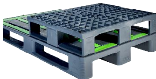
Matches with the Heilbronn Half Pallet