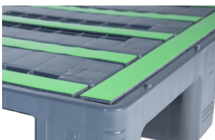
Anti-slip stripes on the top

Suitable for high-bay storage and automated systems