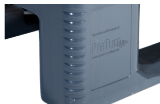
Roundings at each corner for the stretch film