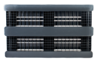
Closed running boards -> high coefficient of sliding friction